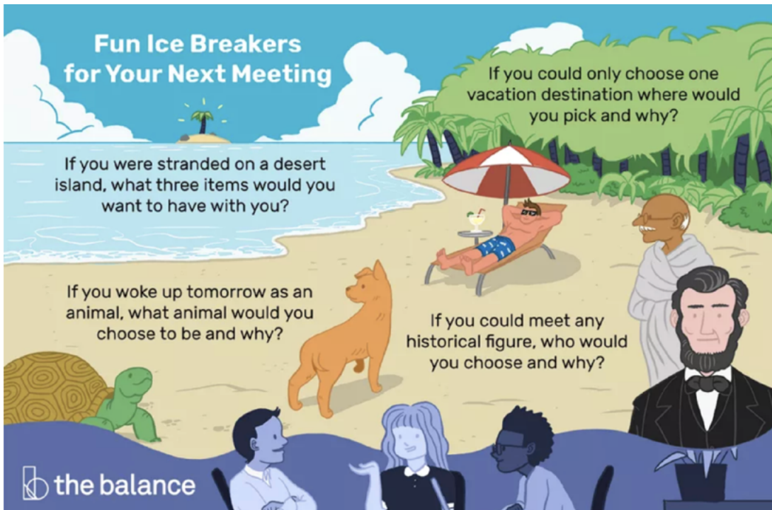
Figure 1 Sample ice breakers 3